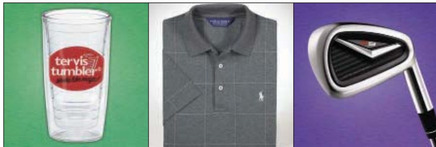
Tervis Tumbler accessories Polo apparel TaylorMade irons

This monthly installment is intended to educate PGA Professionals about the hottest selling golf shop items across the country. We polled the 2000-09 PGA Section Merchandisers of the Year in the public, private, and resort categories, plus AGM members. A summary of the resort facilities' responses appears below. Please remember that this poll is based on a limited number of responses and is an informal measure of actual performance.